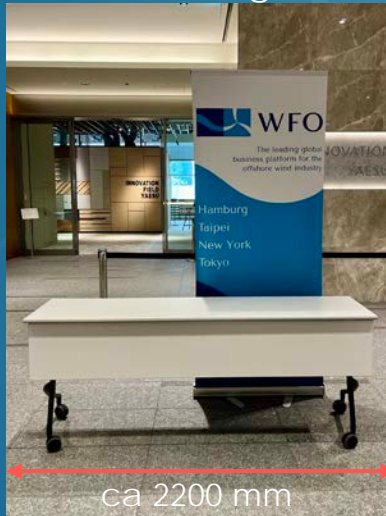
Layout-2 One banner stand behind a long table