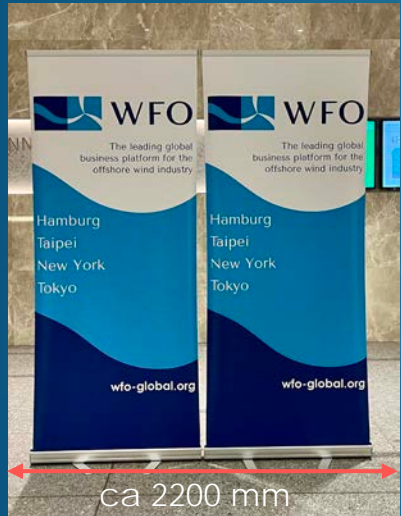
Layout-1 Two banner stands